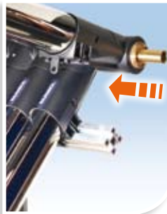
1 Insert Varisol tube